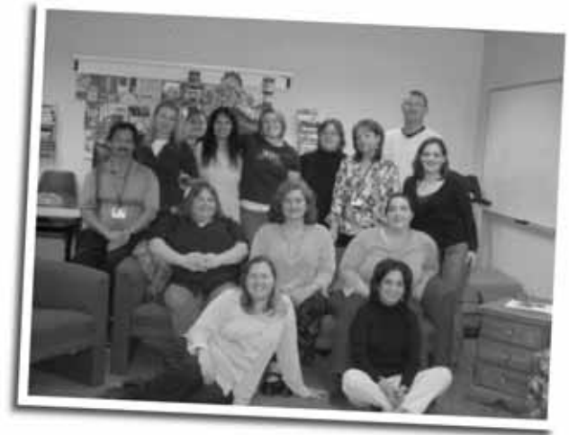
The Esplanade Staff wishes you Happy Holidays!

The Esplanade House staff is encouraged by the progress we see in our clients. Our success rate continues to beat the national average, and we will continually work to be accountable to our clients and our benefactors.